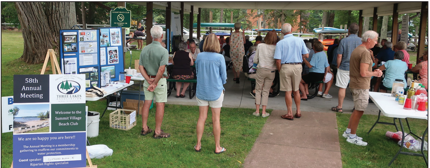
Members gather before the 58th Annual Meeting.