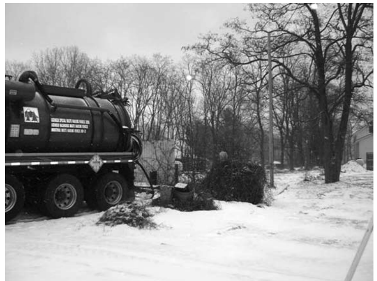
A photo of the vacuum truck belonging to AECOM in Torch Lake Village in March

near the original Standard Service Station. These wells are currently being used to clean up the gasoline. The current AECOM operation vacuums up 2,750 gallons of gasoline-water mix, with the hope of removing 30,000 gallons of gasoline over the 11-month life of the planned remediation, at a cost estimated at just under $50,000. The fluid is trucked to an industrial waste processing plant in Holland, Michigan. Budgetary limits mean that a lot of the gasoline will probably not be removed. That's the bad news. But there are microbes that feast on gasoline and change it into harmless substances. That's the good news. Randy Rothe is the MDNRE specialist in charge. He can be reached for further information at the Gaylord Field Office, 989-705-3416.